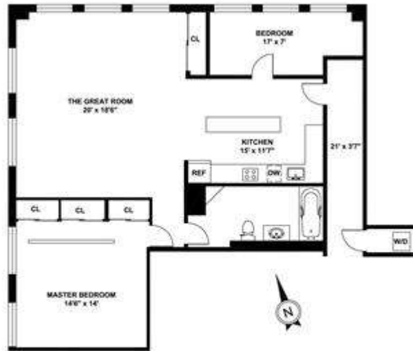
241 WEST 36th STREET APARTMENT 10-R

All information furnished regarding the property for sale, rental or financing is from sources deemed reliable, but no warranty or representation is made as to the accuracy thereof and same is submitted subject to errors, omissions, change of price, rental or other conditions, prior sale, lease or financing or withdrawal without notice. All dimensions are approximate. For exact dimensions you must hire an engineer or architect. Property photos are representative of finishes. Actual finishes may vary.