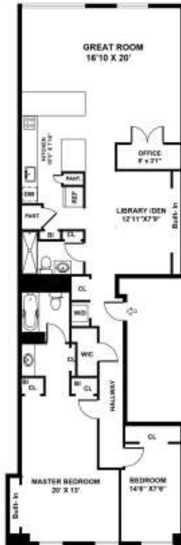
411 WEST 21ST STREET APARTMENT 1

All information furnished regarding the property for sale, rental or financing is from sources deemed reliable, but no warranty or representation is made as to the accuracy thereof and same is submitted subject to errors, omissions, change of price, rental or other conditions, prior sale, lease or financing or withdrawal without notice. All dimensions are approximate. For exact dimensions you must hire an engineer or architect. Property photos are representative of finishes. Actual finishes may vary.