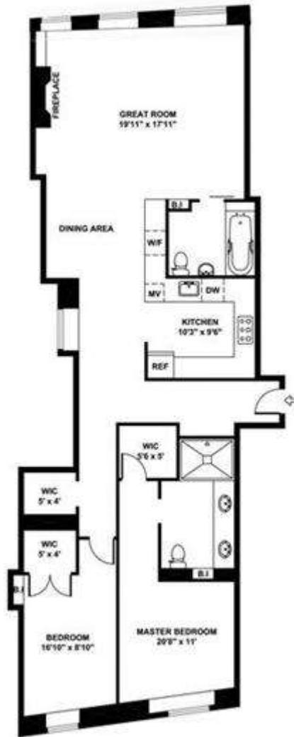
130 JANE STREET APARTMENT 4-HJ

All information furnished regarding the property for sale, rental or financing is from sources deemed reliable, but no warranty or representation is made as to the accuracy thereof and same is submitted subject to errors, omissions, change of price, rental or other conditions, prior sale, lease or financing or withdrawal without notice. All dimensions are approximate. For exact dimensions you must hire an engineer or architect. Property photos are representative of finishes. Actual finishes may vary.